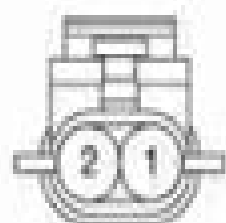
CHG23 Knock Sensor