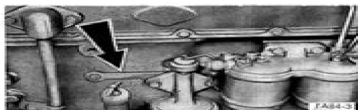
Engine Serial Number