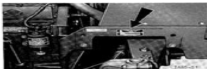
NOTE: Cast iron bolster

The 385, 484 and H84 models have a Code R bevel gear set.