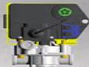
2-Port ABS Relay Valve