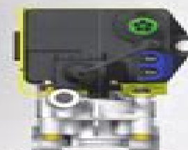
6-Port ABS Relay Valve

2S/1M - 4S/2M PLC Select Anti-Lock Braking Systems