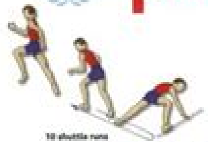
10 shuttle run