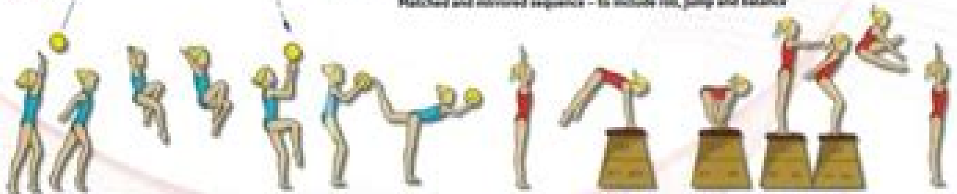
Throw hand apparatus, perform a leap, catch and perform a balance