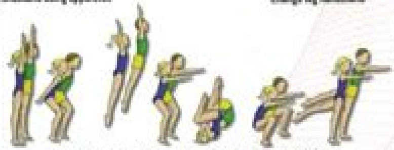
Matched and mirrored sequence - to include roll, jump and balance