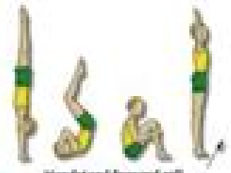
Handstand forward roll