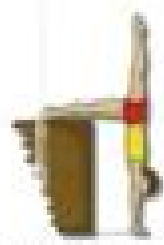
Moving toward handstand using apparatus