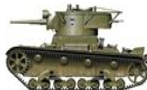
It is very hard to find a good place to live. I am looking for a house with a garden and a garage. I am also looking for a house with a swimming pool. I am also looking for a house with a big garden.