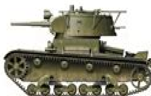
The positive external difference between the 1998 and its predecessor was its emphasis on environmental work.