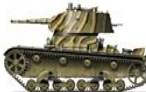
The original 1988 VHS, with three hour-long green sheet camera coverages, belonged to the late Bobbi Johnson of the 60 Minutes crew.