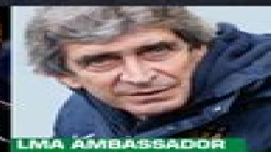
LMA AMBASSADOR MANUEL PELLEGRINI Deadly transitions

EXTRA-TIME INTERVIEW: WITH EXETER CITY MANAGER PAUL TISDALE