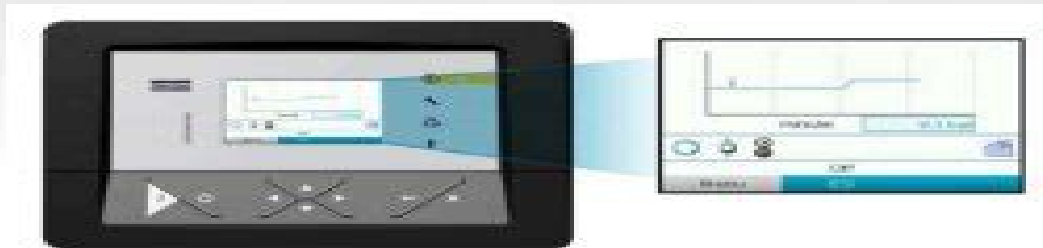
Real time trending

The superior processing capability of the Elektronikon® Mk5 enables a compressor of almost any age or type to benefit from the latest and most advanced control algorithms and functionality, resulting in improved system control and energy savings.