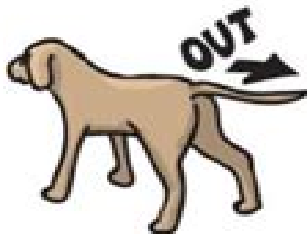
Neutral and exploring