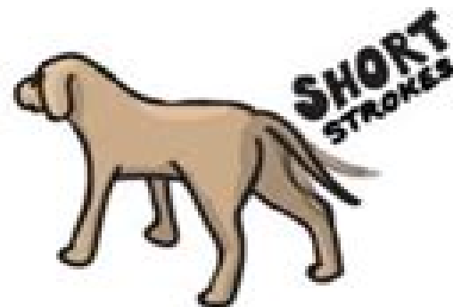
Anxious or uptight