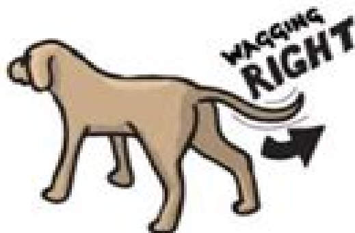
Pleasant about person or animal