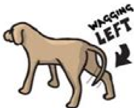
Concerned or unpleasant about person or animal