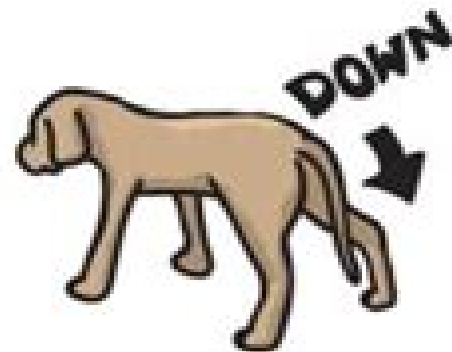
Submissive and concerned