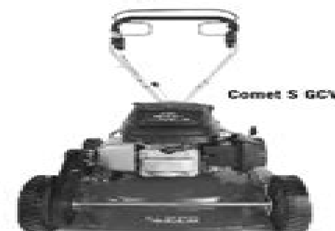
Comet S GCV