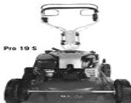
Pro 19 S