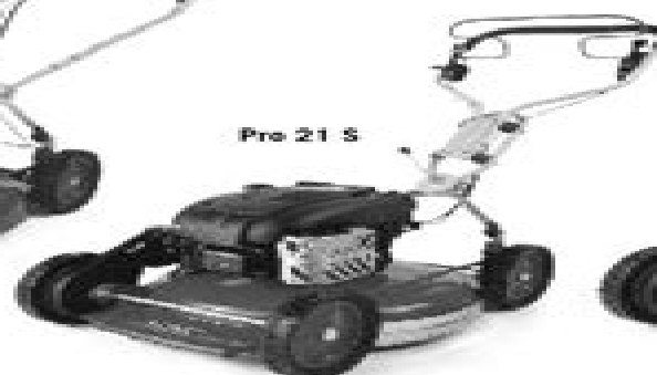
Pro 21 S