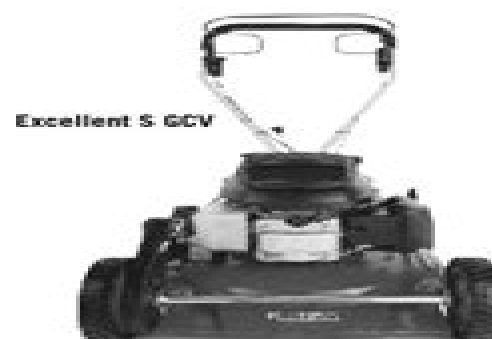
Excellent S GCV