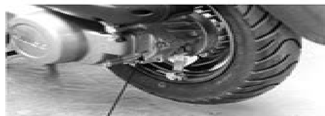
Oil Check Bolt/Sealing Washer