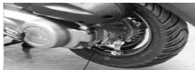
Oil Check Bolt Hole