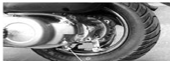
Drain bolt / Sealing Washer

Reinstall the oil check bolt and check for oil leaks. Torque: 0.8~1.2 kgf-m