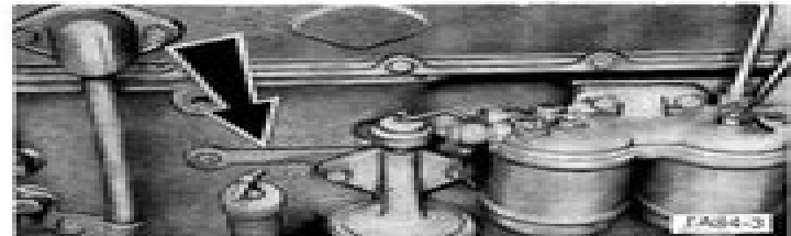
Engine Serial Number

The 385, 484 and H84 models have a Code R bevel gear set.