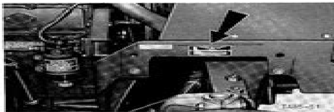
NOTE: Cast iron bolster

The second suffix letter denotes the bevel gear ratio, code R for 12:53 and code T for 11:52 bevel gear ratio.