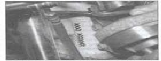
The frame number is stamped on the right-hand side of the steering head.