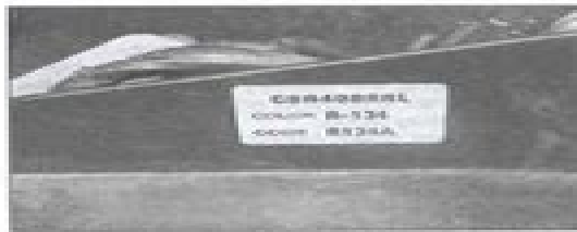
The colour code label is under the passenger seat.