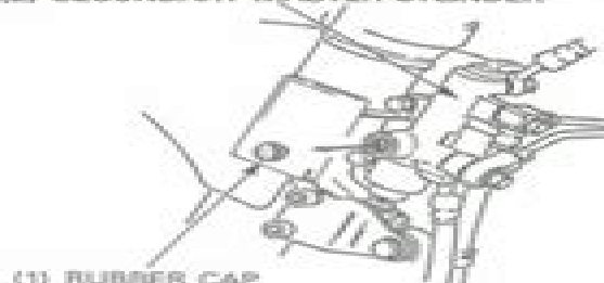
(1) RUBBER CAP