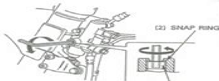
(1) ORIFICE BOLT