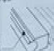
LOCK EDGE SIDE OF SIDE CURTAIN