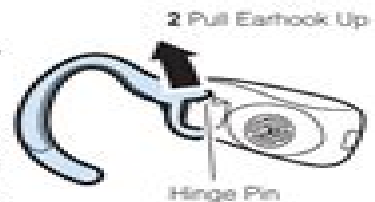
2 Pull Earhook Up