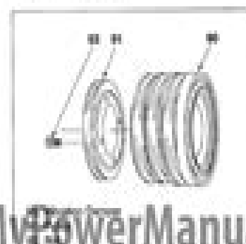
Figure 71. Crankshaft Damper and Pulley