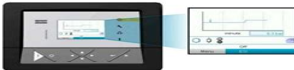
Real time trending

The superior processing capability of the Elektronikon® Mk5 enables a compressor of almost any age or type to benefit from the latest and most advanced control algorithms and functionality, resulting in improved system control and energy savings.