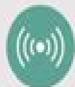
Secured IoT end node sensors