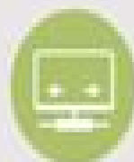
Secured edge gateway AI sensing