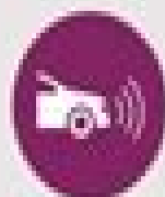
Secured automotive sensor fusioning