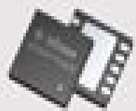
OPTIGA™ Trust M / OPTIGA™ Trust X