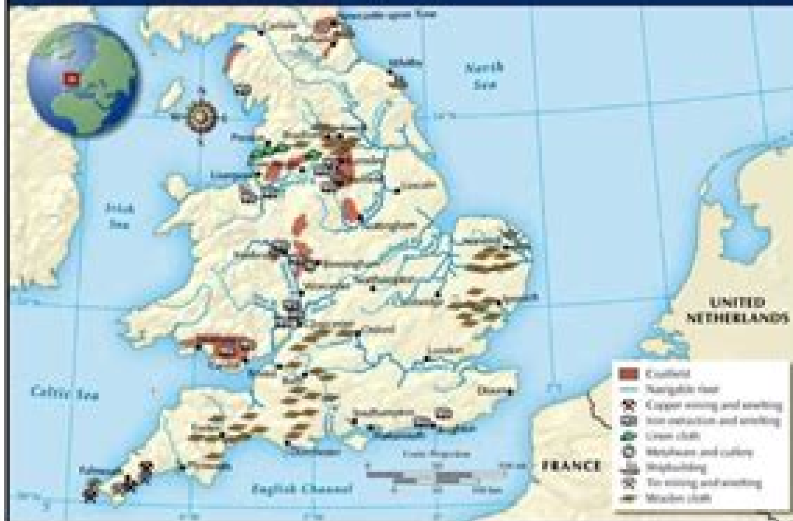
Resources and Industries in England, 1750