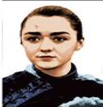
ARYA STARK (Ending) Maisie Williams GOT season 8 (2018)