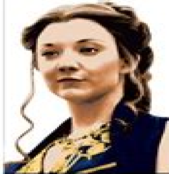
MARGAERY TYRELL Natalie Dormer GOT season 3 (2013)