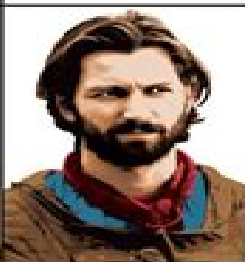
DAARIO NAHARIS Michiel Hulsmann GOT season 5 (2015)