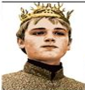
TOMMEN BARATHEON Dean-Charles Chapman GOT season 5 (2015)