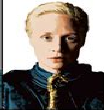
BRIENNE DE TORTH Gwendoline Christie GOT season 4 (2014)