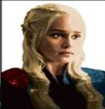
DAENERYS TARGARYEN (Ending) Emilia Clarke GOT season 8 (2018)