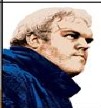
HODOR Kristian Nairn GOT season 6 (2016)