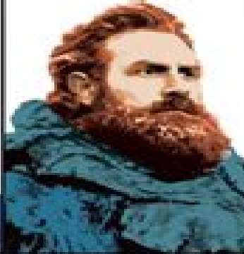
TORMUND Kristofer Hivju GOT season 4 (2014)