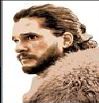
JON SNOW (Ending) Kit Harington GOT season 8 (2018)