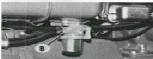
Fig. 11—View of fuel filter and air bleed screw (B).

gear teeth and pump should be 0.01-0.03 mm. Tighten oil pump drive gear nut to 30-34 Nm.