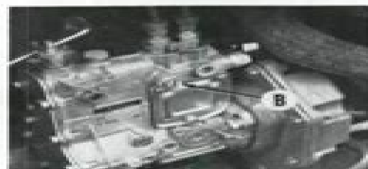
Fig. 12—View showing location of injection pump bleed screw (B).