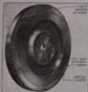
FIG. 4. FLUORIN GLASS AND HYDROGEN FLUORIDE