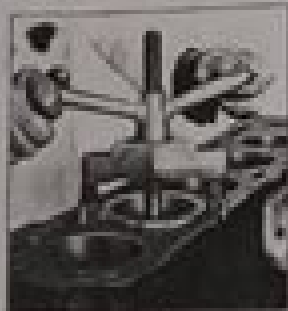
FIG. 5. GLASS CYLINDER LENS