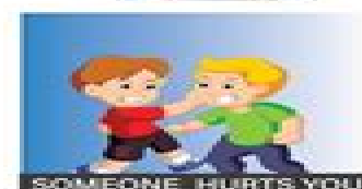
SOMEONE HURTS YOU