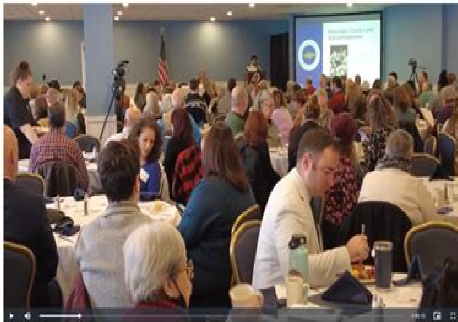
Barnstable County Human Rights Advisory Commission Annual Human Rights Awards Celebration