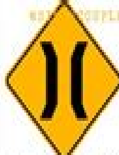
Narrow bridge ahead