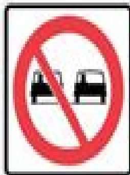
Do not pass