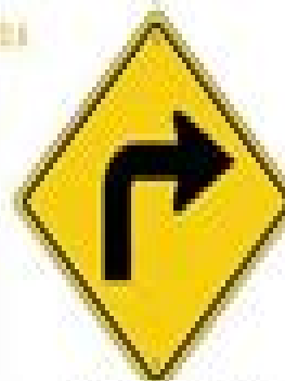
Right turn ahead