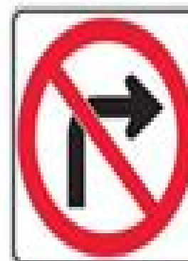
No right turn