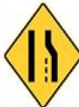
Right lane ends