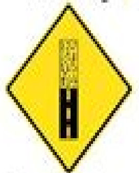
Paved surface ends