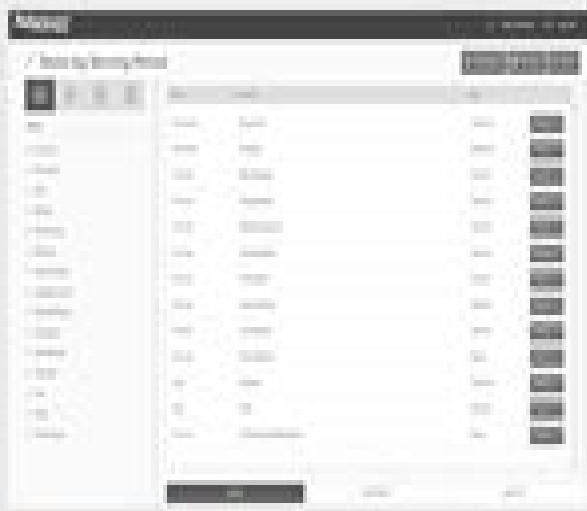
Custom Report Writer