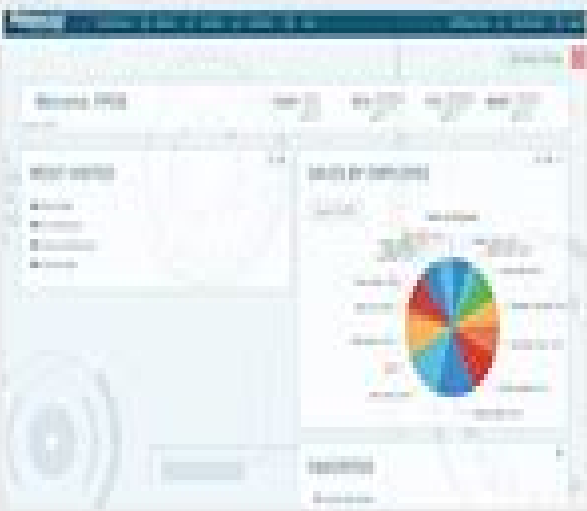
Feature Rich Cloud Based Back Office