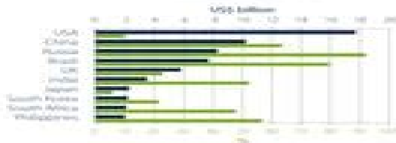
Global advertising revenues