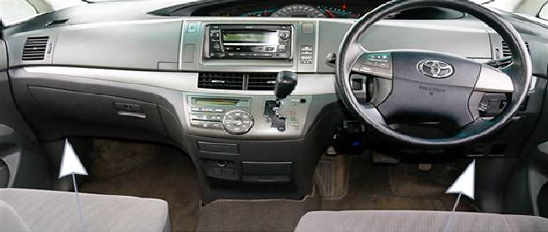
Fuse Box #2