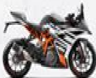
KTM RC 390