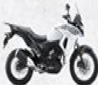
Kawasaki Versys-X 300 ABS