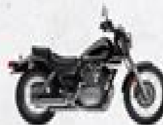
Yamaha V Star 250 Raven