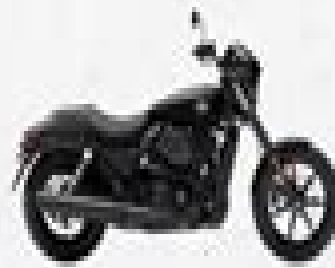
Harley-Davidson Street 500