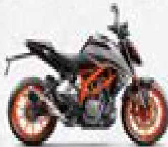
KTM Corner Rocket (390 Duke)