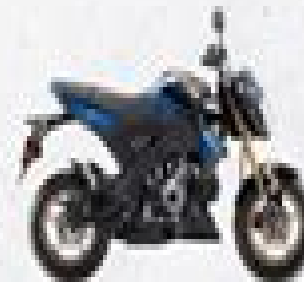
Kawasaki Z125 Pro SE