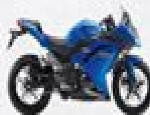
Kawasaki Ninja 300 ABS