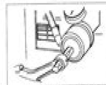
Figure 83: Pressing the Connecting Rod Piston Pin Bushing