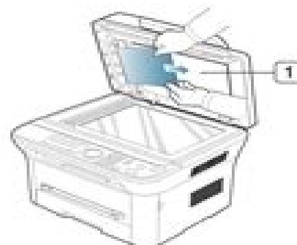
1. scanner lid