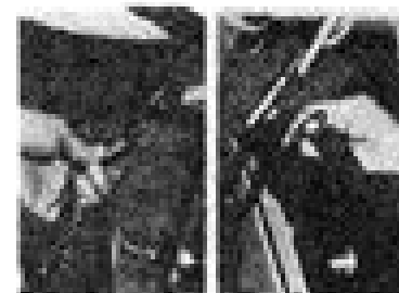
Fig. 1-7: Clutch Cable Removal

Care should be exercised so as not to bend or kink the inner wire.