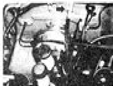
Fig. 1-4: Clutch Pedal Free Travel Adjustment (1)

The clutch pedal free travel can be adjusted to specification by changing the location of the E ring. The E ring has been marked with one of the 18 grooves provided at the center cap that is located at the upper end of the outer wire of the clutch release cable. Carry out the adjustment as follows: