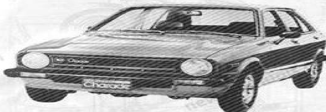
Fig. 1 Front View of Daihatsu CHARADE XG