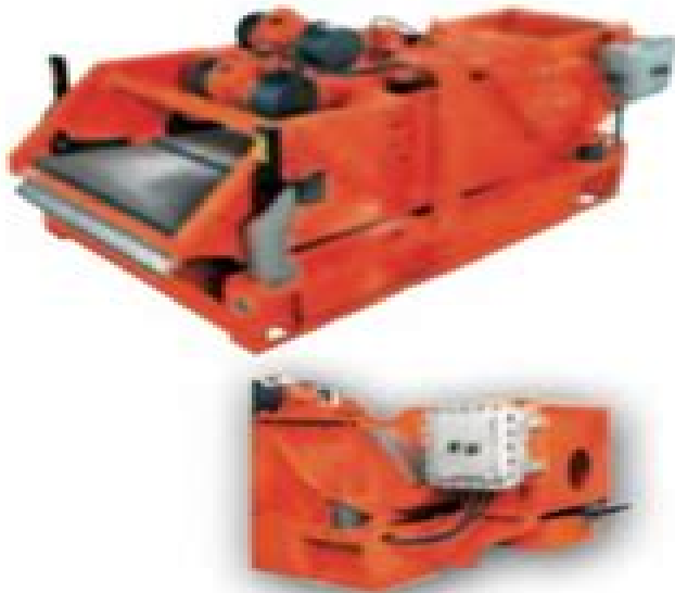
Shaker with Possum Belly