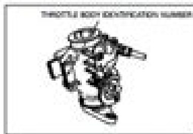
THROTTLE BODY IDENTIFICATION NUMBER The throttle body identification number is stamped on the front side of the throttle body.