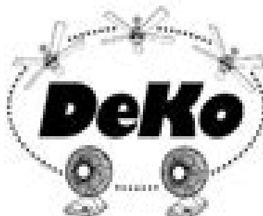
Decken-Ventilator Ceiling Fan