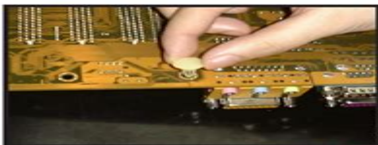
Black mounting pin

Snap black mounting pins onto the mainboard as shown. Carefully install the mainboard into the computer chassis and align the corresponding mounting holes on the mainboard with the holes on your chassis. While chassis design varies you may need to refer to the chassis manual for the mainboard mounting area. Insert white pins through the chassis and through the mounting holes on the mainboard into the black pin making sure they are snapped fully into place.