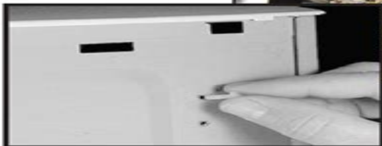
Insert white mounting pin