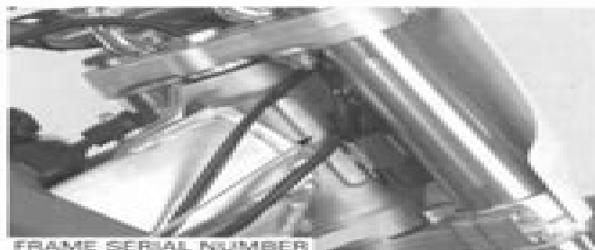
FRAME SERIAL NUMBER

(1) The frame serial number is stamped on the right side of the steering head.