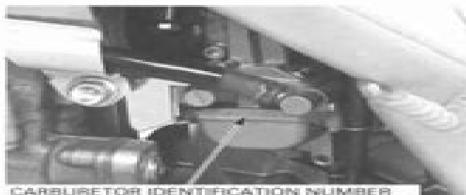
CARBURETOR IDENTIFICATION NUMBER

(2) The engine serial number is stamped on the left side of the lower crankcase.