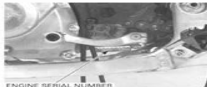
ENGINE SERIAL NUMBER

(1) The frame serial number is stamped on the right side of the steering head.