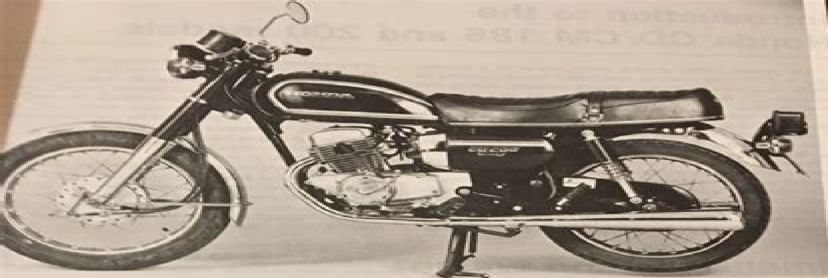
Left-hand view of 1980 Honda CD200