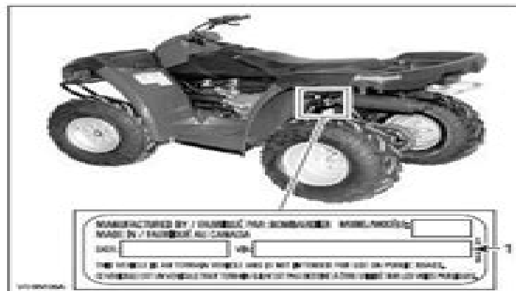
1. VIN (Vehicle Identification Number)