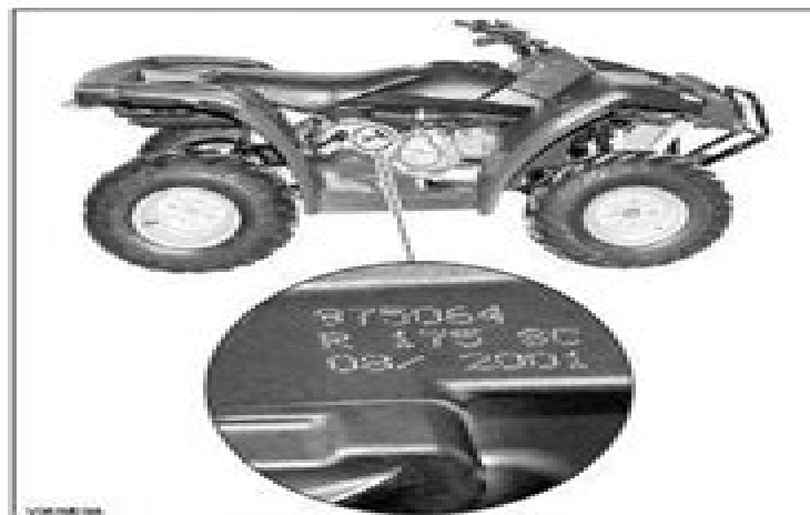
E.I.N. (ENGINE IDENTIFICATION NUMBER)