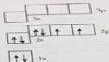
Oxygen 1s^2 2s^2 2p^4