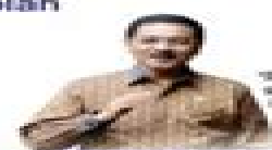
MENDAGRI Period 2009-2014 Dr. H. Gamawan Fauzi, SH, M.M.