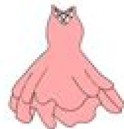
Getting a New Dress