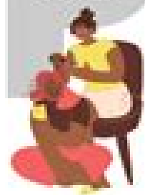
Getting a Haircut