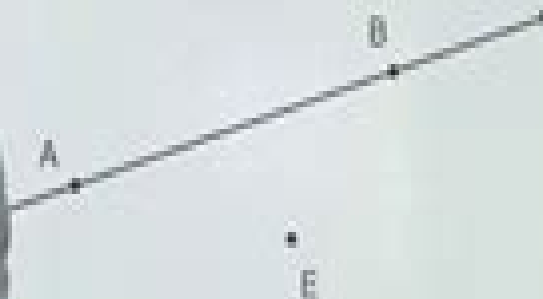
Fig. 2A and B.