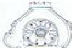
Ford 14, 209, 302, 351C, 351W