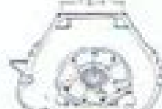
Ford 13, 429, 460, 251-6, 420R