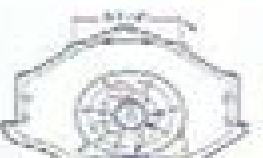
GM TH-400, 350, 250-48, 700R4, 3.80, 4.10, 4.60R Chevrolet