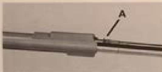
2. To complete assembly, insert the lower wand, large end first, into sheath from the bottom until the latch (A) engages.