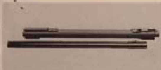
1. The upper wand, sheath and cord have been preassembled at the factory.