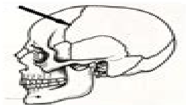
a. suture - synarthroses