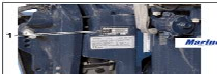
1. Model and serial number

Model and serial numbers are located on the swivel bracket and on the powerhead.