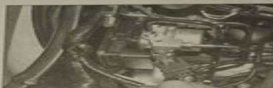
18.4c ... then disconnect the connector

13 Once the reset procedure has been confirmed, turn the ignition (main) switch OFF, disconnect the mode select switch and install