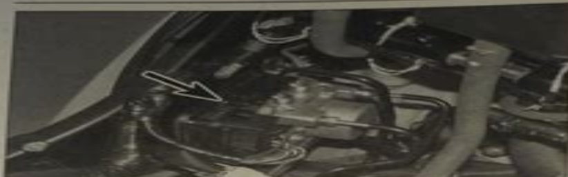
18.4a Location of the ABS control unit