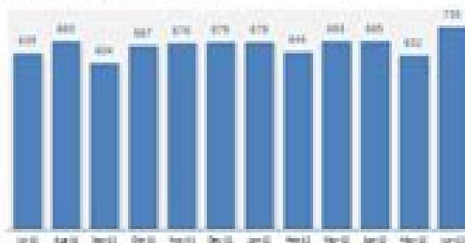
Entries 12 months to Jun 12