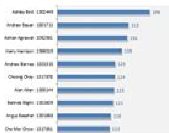
Annual Leave Days